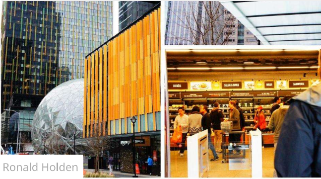
The first Amazon Go store at Amazon's corporate